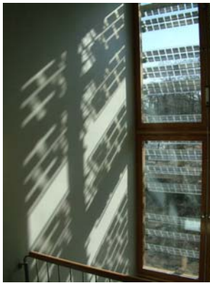
Sweden, Hammarby Sjöstad PV integrated in sunshading