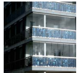
Finland, Ekovikki PV integrated in balcony fronts

Read more about PV Nord – the Widespread use of Building Integrated Photovoltaics in the Nordic Dimension of the European Union at