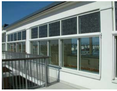
Sweden, Hammarby Sjöstad PV integrated in windows, balconies and facade

Paving the way for Building Integrated Photovoltaics in the Nordic dimension