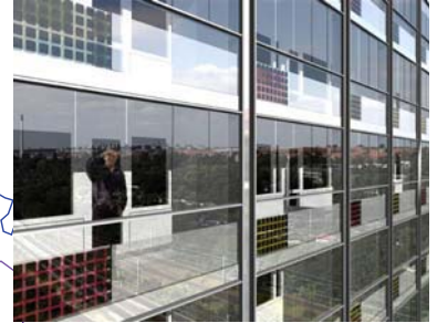
Denmark, Copenhagen PV integrated in balcony fronts